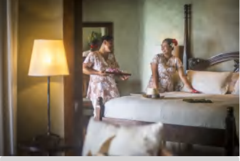
FRIENDLY LOCAL STAFF