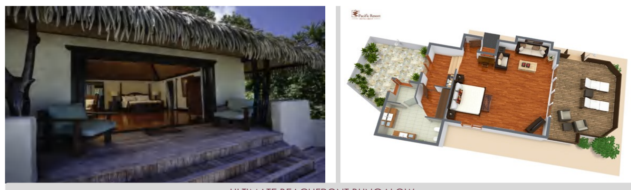
ULTIMATE BEACHFRONT BUNGALOW