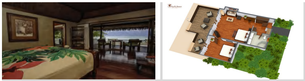
PREMIUM BEACHFRONT BUNGALOW PLUS