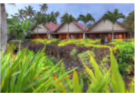
LAGOON VIEW VILLAS