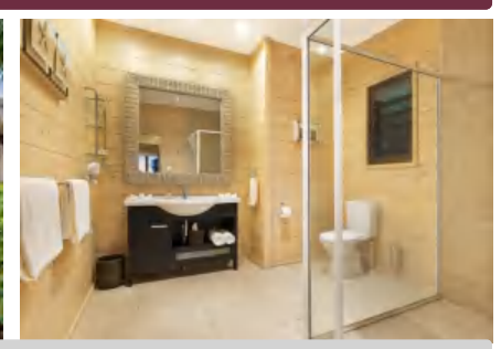
LAGOON VIEW EXECUTIVE VILLA