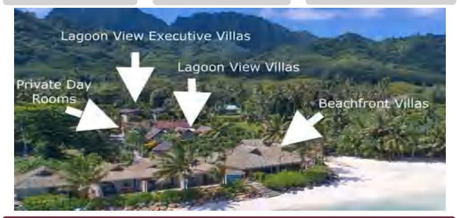
1 BEDROOM BEACHFRONT VILLA (VILLA 2) 2 BEDROOM BEACHFRONT VILLA (VILLA 2)

2 & 3 BEDROOM LAGOON VIEW EXECUTIVE VILLAS