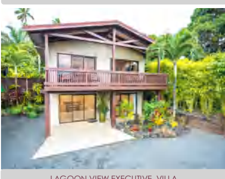
LAGOON VIEW EXECUTIVE VILLA