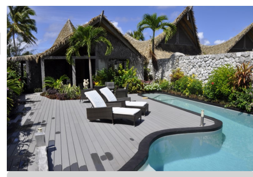
RELAX BY THE POOL

**Due to our Covid-19 precautions, we recommend guests bring their own snorkelling gear and face mask, or