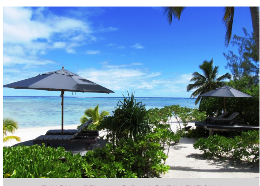
ENJOY A RELAXING DAY OUT IN THE SUN