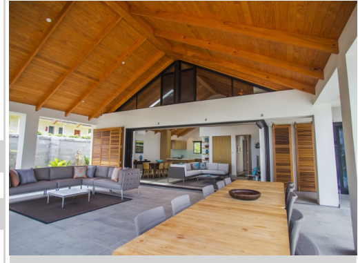
Outdoor living and dining space