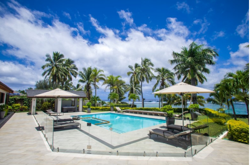
Breath-taking view of the swimming pool and beachfront