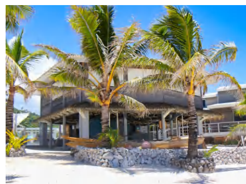
VIEW FROM THE BEACH