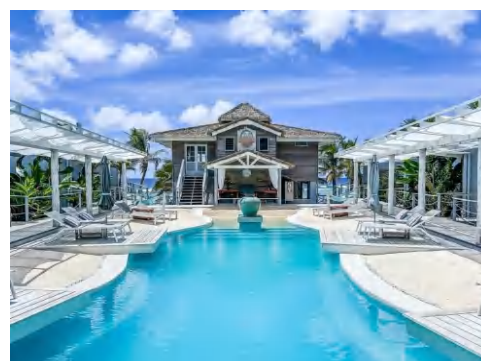
SALT WATER SWIMMING POOL