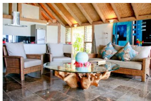
ONE BEDROOM LOUNGE AND KITCHEN