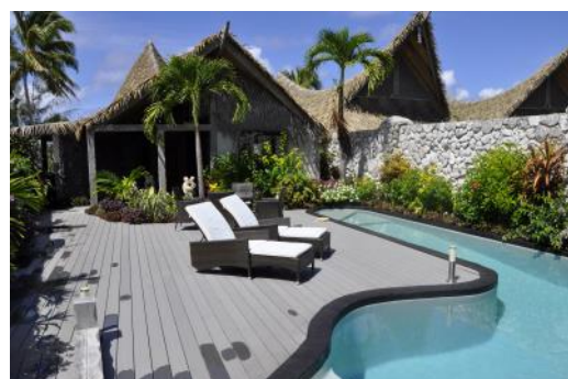
PRIVATE COURTYARD & SWIMMING POOL