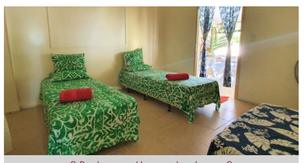
2-Bedrooom House - bedroom 2