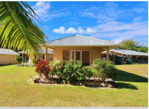
Self-contained Unit exterior