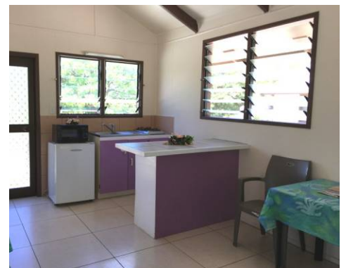
KITCHEN IN STUDIO BUNGALOW