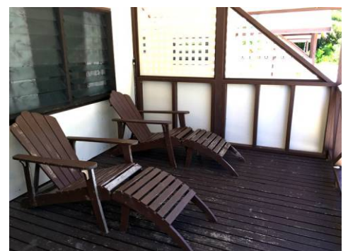
SUN LOUNGERS ON THE BALCONY