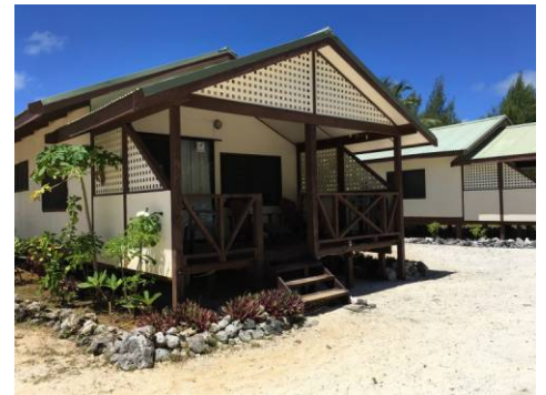
RANGINUI'S SUNSET BUNGALOWS

Ranginui's Sunset is the perfect retreat for the budget conscious traveller, those who aren't interested in the big commercial properties will definitely enjoy it here.