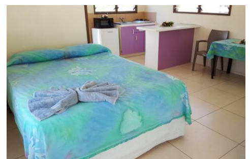
ISLAND STYLE BEDDING