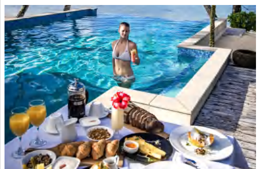
BREAKFAST BY THE POOL