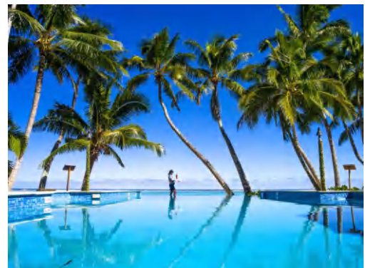
SALTWATER INFINITY POOL