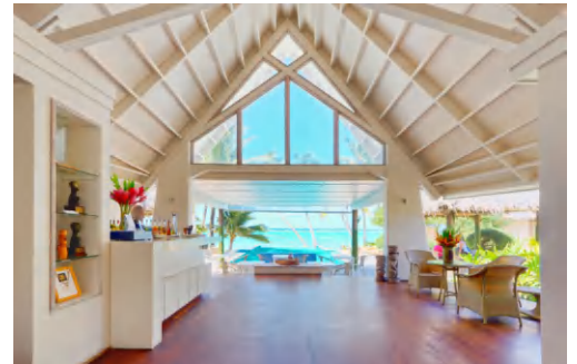
MAIN ENTRANCE AT LITTLE POLYNESIAN

Relish the privacy, seclusion and luxury and indulge in a Cook Island tropical vacation experience which will stay in your hearts and minds forever. Enjoy Little Polynesian Resort.