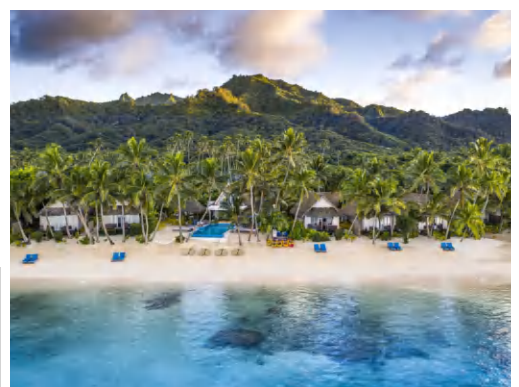
RELAX ON THE BEACH