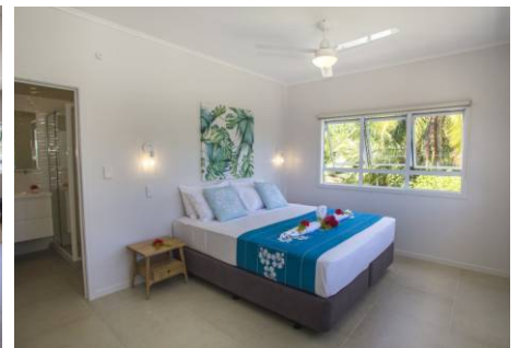
2 BEDROOM APARTMENT