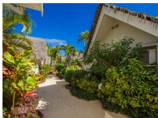
PREMIUM GARDEN SUITES