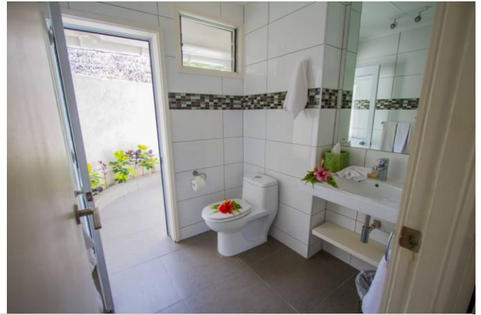
PREMIUM GARDEN SUITE