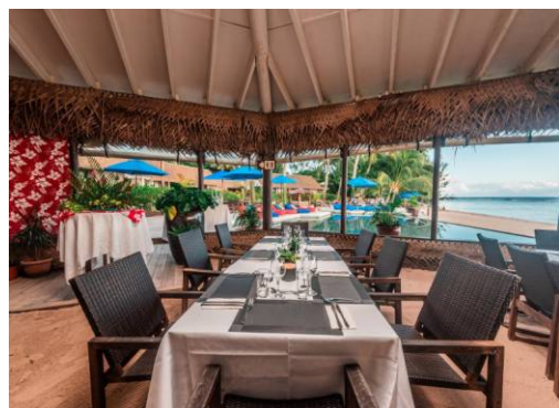
ON THE BEACH RESTAURANT & BAR