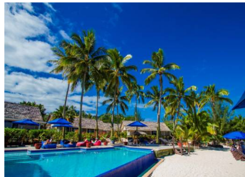
MANUIA BEACH RESORT

Manuia Beach Resort provides an idyllic Cook Islands getaway coupled with an absolutely amazing tropical experience. Guests settle-in and feel relaxed from, the moment they arrive, and depart fully refreshed and rejuvenated.