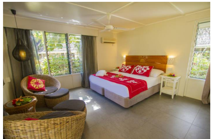
VIP GARDEN SUITE & VIP BEACHFRONT SUITE