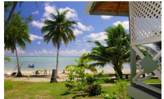
Lovely view to lagoon & beach