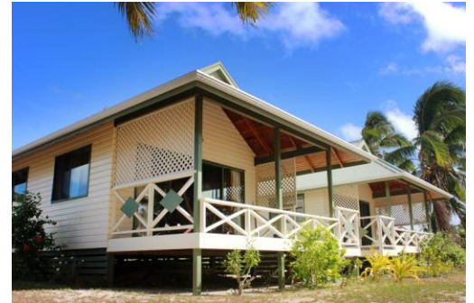
Paparei Bungalows awaits...

Room service is done twice weekly. Tours, rental cars or scooters can be arranged for you on request.