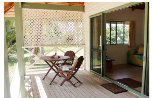
Private Balcony with Chairs for Relaxing