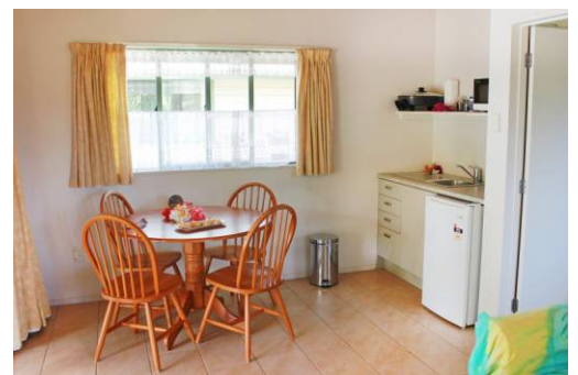
Dining & Kitchen Area