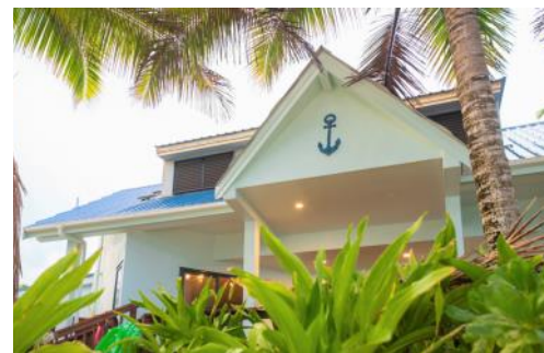
Anchors Sand awaits.....

This property is within walking distance to the popular Charlies Café & Bar located on the beach, a great place to relax with a beverage and enjoy some local entertainment.