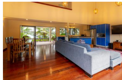
Spacious Lounge Interior