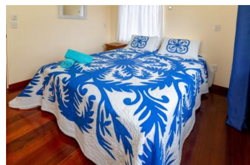
Comfortable King Size Bedding