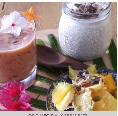
ORGANIC DAILY BREAKFAST