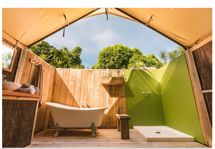
ARIKI SAFARI TENT