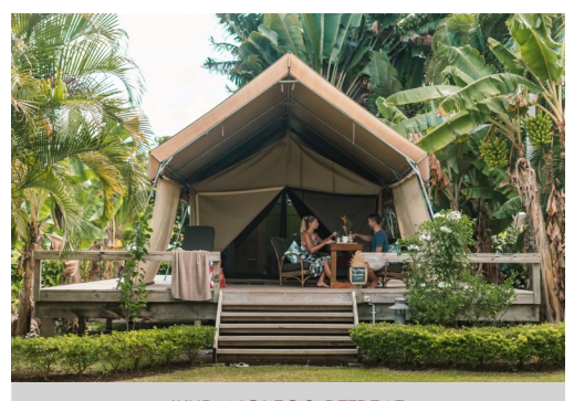
IKURANGI ECO RETREAT

Daily tropical breakfast delivered to your room, free use of snorkelling gear, bicycles, swimming pool. *Complimentary bottle of bubbles for Ariki Safari Tent bookings