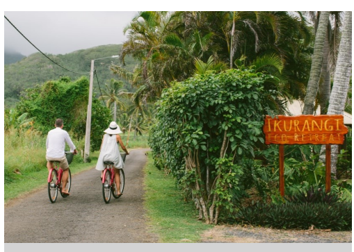
EXPLORE AT YOUR LEISURE