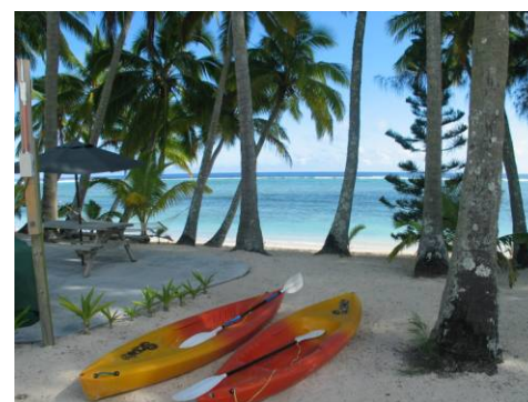
KAYAKS ON THE BEACH