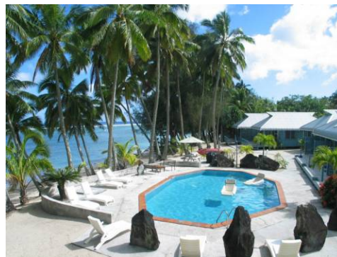
SUNHAVEN BEACH BUNGALOWS

Situated away from the busy island traffic and directly on the beach, Sunhaven Beach Bungalows makes for a peaceful, relaxing tropical holiday with easy access to outside conveniences.