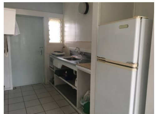
BASIC KITCHEN FACILITIES