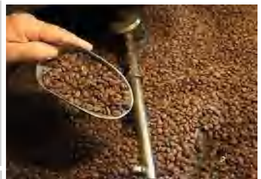
ATIU ISLAND COFFEE