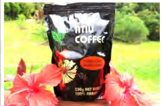
PROCESSED COFFEE BEANS